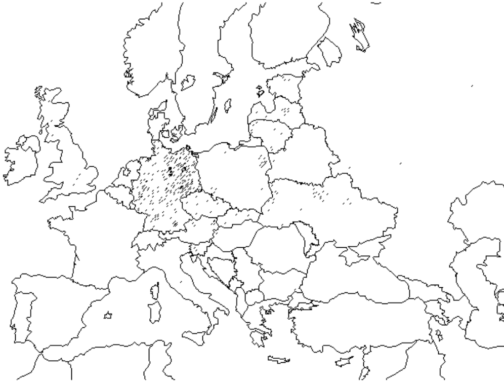
Fig. 1. Location of study plots for the Monitoring of Raptors and Owls in Europe.